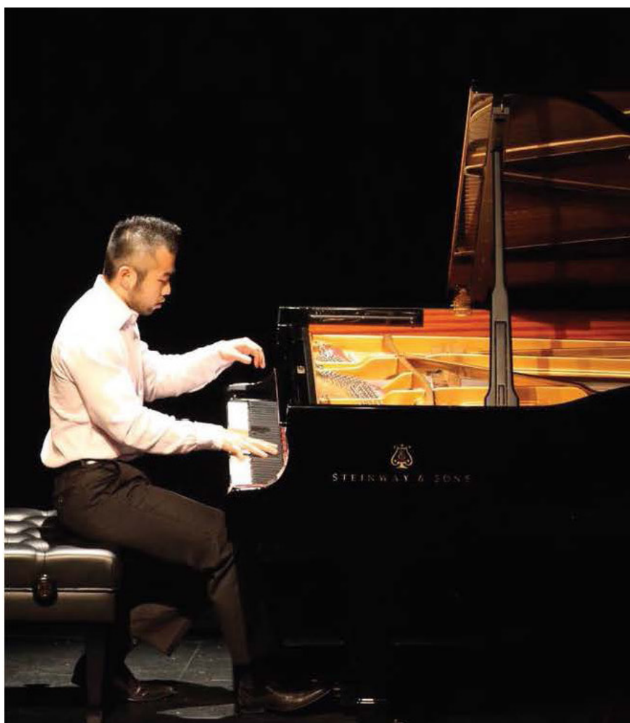
Alicia Zeqir - Q Photography

"For me expressing the music is about being very true to what you believe in and being very genuine."