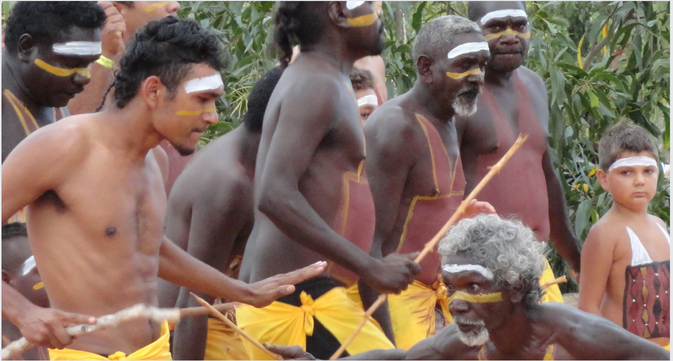
Yolngu dancers at the Garma Festival , East Arnhem Land