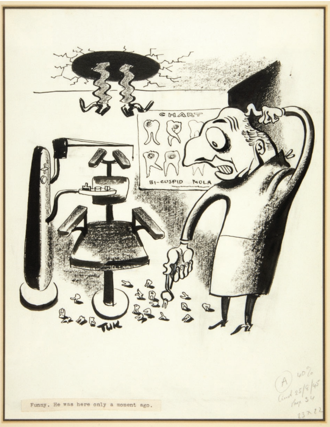
Fig. 2. Albert Tucker, Australian, Funny. He was here only a moment ago. , 1945, ink and felt tipped pen and pastel on paper; 31.4 x 24.3 cm (mount), 52.3 x 45.0 cm (frame). Private collection.

The wall chart of anthropomorphic teeth in the background of the cartoon includes more motifs from the Images of Modern Evil series. On one half, the subtitle of hyphenated ‘BI-CUSPID’, together with the dancing teeth suggest a ‘kind of sexuality’ and moral corruption not usually published in newspapers of the day. The series always had a female form in each painting; here one of the teeth has ‘very feminine imagery’ with a single stylised eye. The ‘masculine’ teeth have a single eye which could have transmogrified from a carious crater. The subtitle in the other half of the chart ‘MOLA’ is comparable to the iconic Melbourne Street advertising signs of ‘ASPRO’ and ‘HOYTS’,