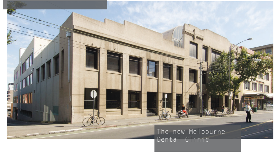
The new Melbourne Dental Clinic