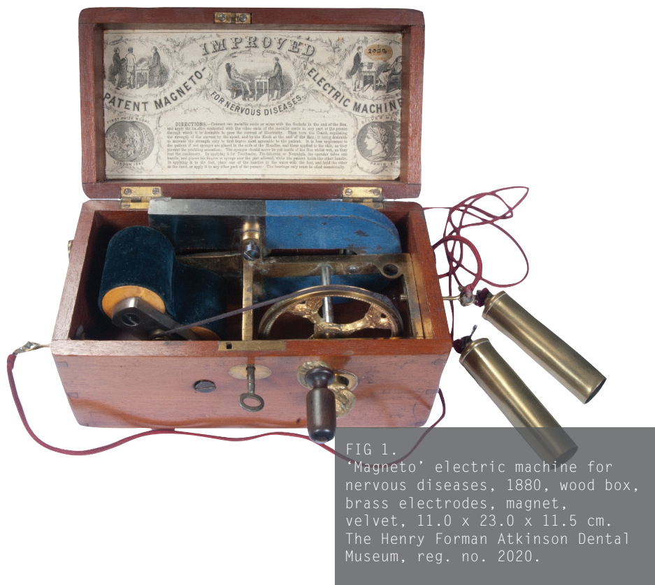
FIG 1. "Magneto" electric machine for nervous diseases. 1880, wood box, brass electrodes, magnet, velvet, 11.0 x 23.0 x 11.5 cm. The Henry Forman Atkinson Dental Museum, reg. no. 2020.

solve the problem by offering an in house power station that consisted of a Gardnier gas engine with a dynamo that ran off the town gas supply. The claim was made that the engine would run all day for the cost of a few pence and required little maintenance. The availability of such equipment is an example as to how dentistry kept in step and up to date with advances in engineering and science. D